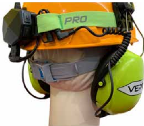
REAR RIGHT SIDE VIEW