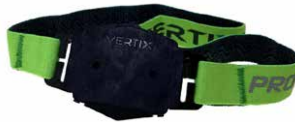
PRO Elastic Helmet Mount