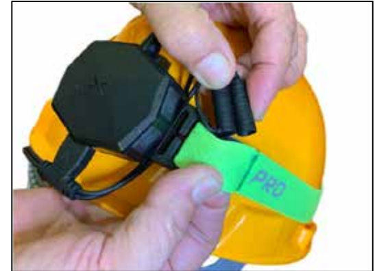
Insert 3.5mm connectors under strap and over into left and right strap pockets