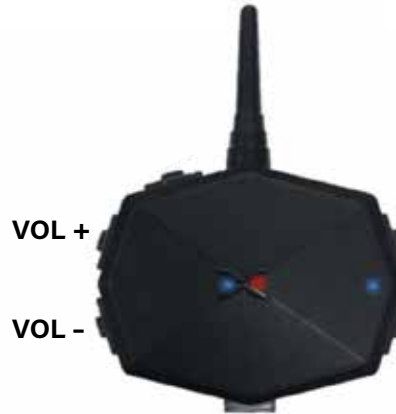
VOL + VOL -