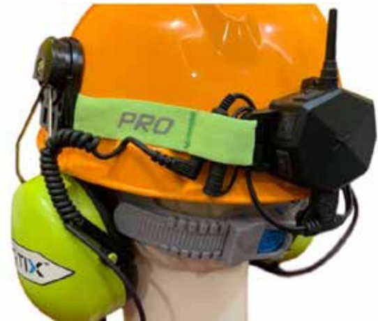
REAR LEFT SIDE VIEW