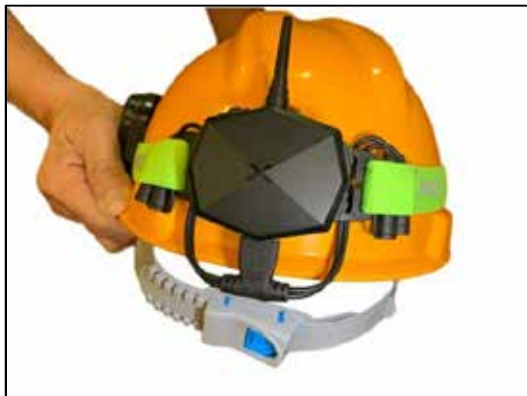
Completed helmet mounting set-up

Installation shown on helmet without earmuffs attached for better clarity