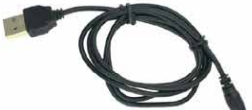
USB On-the-Go Charging Cable