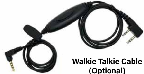
Walkie Talkie Cable (Optional)