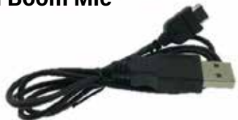
USB Charging & Data Cable