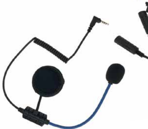
Left Speaker with Boom Mic