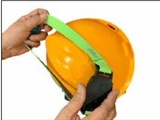
Install strap on helmet